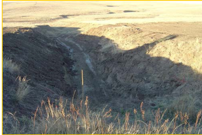
Excavation of former disposal trench